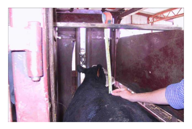
Figure 1. Manual method of measuring hip height using a tape